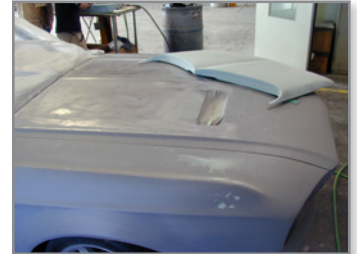
Figure 7: Hood scoop