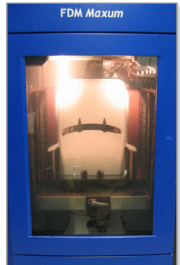
Figure 11: Scale model is built on an FDM Maxum