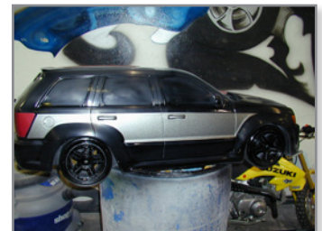
Figure 12: Painted Jeep model

For more information about Fortus systems, materials and applications, call 888.480.3548 or visit www.fortus.com