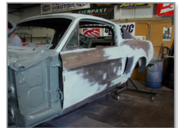
Figure 5: Body restoration