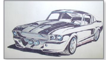
Figure 2: Sketch

Since Phillips' next step would be to scan his custom parts, he had only to model one-half of the bumper, console and grill and one each of the side and front scoops. With the 3D scan data, he