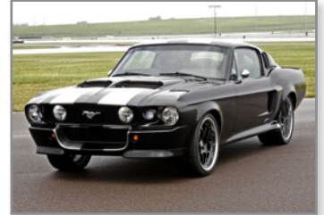
Figure 1: PIT VIPER

Upon inspection of the Pit Viper, SEMA attendees will see that Phillips' goals of symmetry and fit were achieved with this new process. What they cannot see is the tremendous savings in man time, the acceleration of the project and the savings in cold, hard cash. Phillips estimates that the