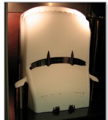
Figure 6: 1/4 scale part built on FDM Maxum