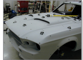
Figure 3: Photogrammetry