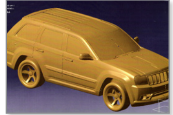
Figure 10: Scan of Jeep

TPI Performance, Wichita, Kan., specializes in auto restoration and repairs on classic cars, muscle cars and street rods. With roots in auto racing, the company has been in business for 15 years. The 16 person TPI crew includes nationally recognized fabrication personnel.