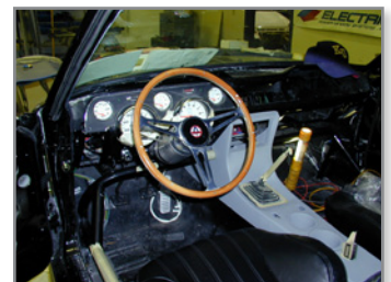
Figure 9: Console