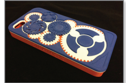
Figure 1: Multi-color FDM ABS-M30 mobile phone case.

NOTE: Descriptions of all the commands are available through the Insight ™ software help menu. Many of these settings can have detrimental effects on your parts if not used properly. It is recommended that only experienced users make changes to these values. To ensure the best possible part quality, Stratasys ® recommends that you always review the toolpaths on your parts and make modifications if necessary, before downloading them to your system.