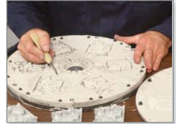
Figure 5: Gates, runners and vents are cut into the rubber mold with a sharp knife or scalpel.

Tekcast Industries, Inc. ( www.tekcast.com ). All images courtesy of Tekcast Industries, Inc.