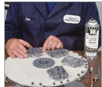
Figure 3: Patterns, center plug and locknuts are placed on the uncured rubber disk.