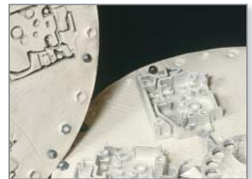
Figure 8: After the metal has cooled, separate the mold to expose the castings.