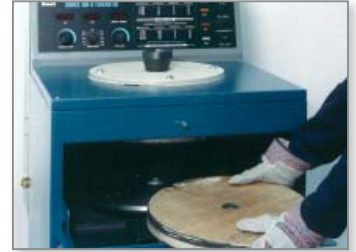
Figure 6: The mold is loaded into the spin casting machine.