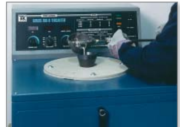
Figure 7: While spinning, molten metal is poured into the mold.