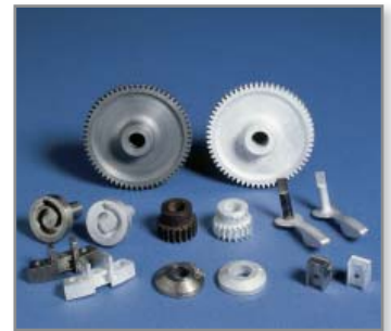
Figure 1: Spin casting produces parts in metals with low melt temperatures.