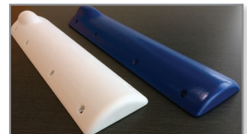
FDM distal cover to be used as a mold master: before finishing and painting (left) and after (right).