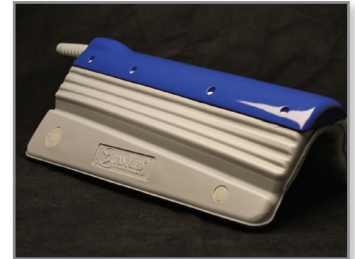
A production MRI coil assembly with a finished and painted urethane distal cover. The distal cover was cast using silicone molding.

Today, ScanMed prints its smaller part mold masters in-house on their Stratasys 3D printers in one to two days for about $400 each — a time savings of 71% and cost savings of 60% as compared to CNC machining.