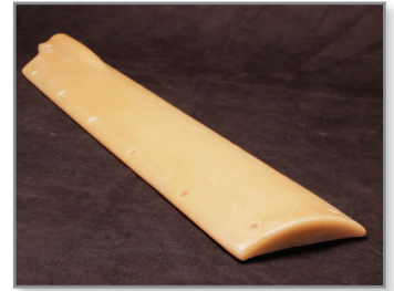
Cast urethane distal cover ready to be finished, painted and mounted on the MRI coil assembly.