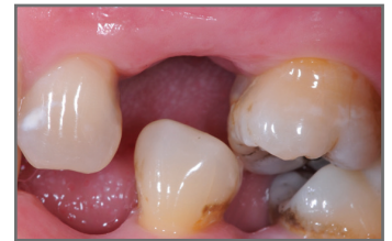
Photo showing the patient's mouth before surgery.

Using the Stratasys 3D Printer, doctors at T32 know what to expect before beginning a surgery so they can create comprehensive treatment plans that address any challenging or critical decisions beforehand. The models and surgical guides also reduce guesswork and the