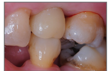
Photo showing the patient's mouth after surgery.

Stratasys | www.stratasys.com | info@stratasys.com