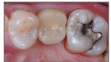
After drilling, the implant is placed into the patient's mouth.