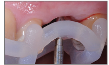
During surgery the guide pinpoints the location and angle for drilling.