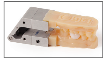
Objet 3D printed articulated dental models

Stratasys | www.stratasys.com | info@stratasys.com