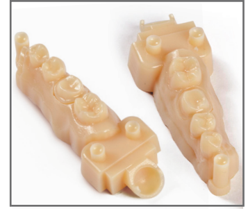
Apex uses an Objet Eden 3D printer to make crowns, bridges, inlays, etc.

“Rapid manufacturing is an affordable and attractive option for dental lab owners,” Brown concluded. “With an Objet 3D Printer, APEX Dental Milling Center was able to realize a complete digital workflow for in-house fabrication of models of any size or shape. Efficient in-house manufacturing opens many new indication possibilities.”