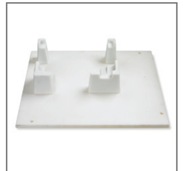
The custom assembly pallets consist of four plastic posts on a Bosch aluminum pallet base. Unit with plastic base shown here is used as a backup.

Stratasys | www.stratasys.com | info@stratasys.com