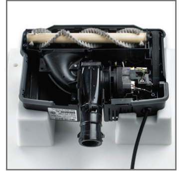
The motor, brush, and other components are assembled inside the cover.

"We keep the Fortus systems working 24/7," says Fish. Besides creating fixtures, Oreck uses FDM technology extensively to produce prototypes, as well as models for marketing photos and commercials. "We also use the machines to produce specialized assembly tools, CMM (coordinate measuring machine) fixtures, engineering test fixtures, and CNC milling fixtures. We also make complete mockups. The machines are only limited by your imagination."