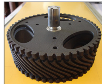
A wheel from Artem BBC moon buggy – the Dimension 3D Printer can be used to produce functional moving parts, as well as prototypes and models.

Stratasys | www.stratasys.com | info@stratasys.com