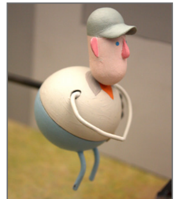
Model makers painted the charming finishing touches on the farmer and his family.