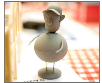
This farmer's face was part of a tray of models printed overnight.

"The beauty of using the Dimension 3D Printer for this project was that we could produce exact replicas of the animatic drawings, rather than guessing about sizes and details as we might have done with hand-sculpted models," Thorne said. "To be honest, before we got the Dimension 3D Printer, we would have subcontracted out this type of work, but now that we have the right tool for the job, we are saving both time and money."