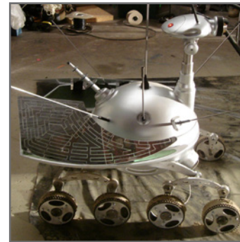
Special effects designers at Artem built this moon buggy prop for a BBC advertisement using parts created with a Dimension 3D Printer.