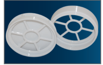
JGR engineers can now build carbon monoxide filters out of polycarbonate, which withstands high temperatures.