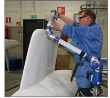
The TDF often reverse engineers components to make the replicas.

[Editors’ Note: The TDF (Trainer Development Flight) has won the 2008 Air Force Chief of Staff Team Excellence Award for its use of FDM technology and other advanced production methods. It is recognized as the premier center of excellence for manufacturing trainers and training aid products for the Air Force and other required Department of Defense agencies.]