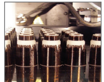
With direct digital manufacturing, the TDF can produce batches of components.

Stratasys | www.stratasys.com | info@stratasys.com